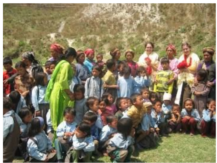
Unforgettable greeting in Komin

Furthermore the school committee announced again the urgent need of a further classroom and a fence around the school terrain. Furthermore the employment of an English teacher is as well very necessary.