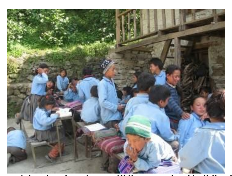
The lessons take place in nature until the new school building is ready