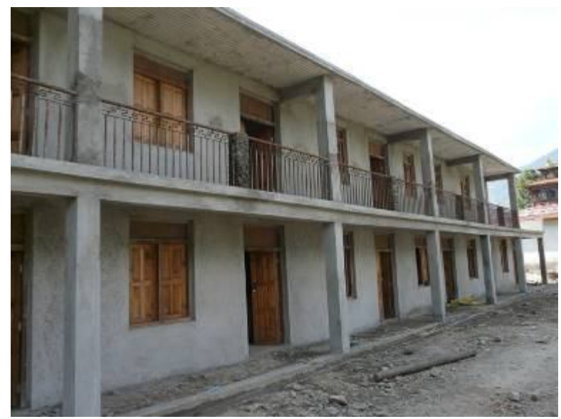
New school building in Thulo Shafru