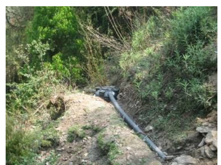
Water tank and pipes