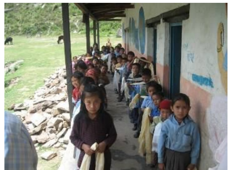
Overwhelming greeting from the pupils