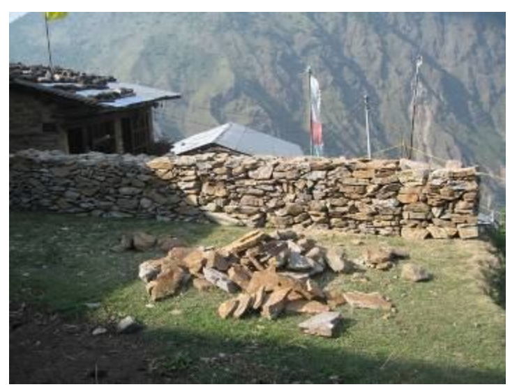
Stones for the protection wall

As soon as the work is finished and the families will provide evidence about the money, which they spent for the reparations, we will deliver the rest of the donations. The costs for reparation and material are approximately 70.000 NPR.