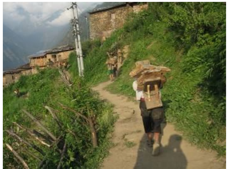
Delivery of stones