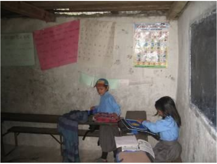
Class room in Brabal