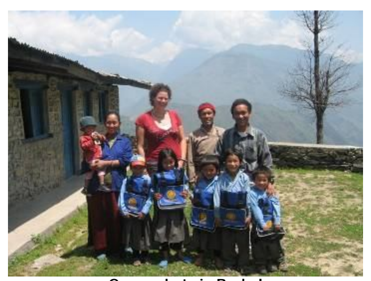
Group photo in Brabal

In June we delivered new school uniforms, school bags, pencils and exercise books to the five students in Brabal. Furthermore we gave some of the material donations from Germany to the school.