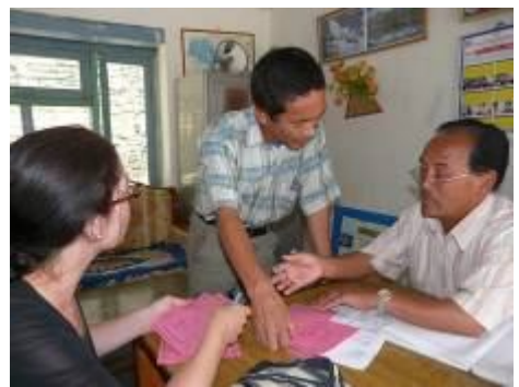
Inside the Director's room

Would you like to support a child financially? Write us, we mediate the personal contact to "your" godchild and settle all formalities with the respective school.