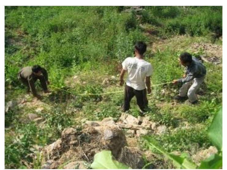
Measurement for the protection and stabilization wall