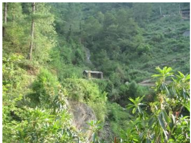
Water and grain mill in Thulo Shafru

After the Monsoon rain has started in July 2009 the mill starts running.