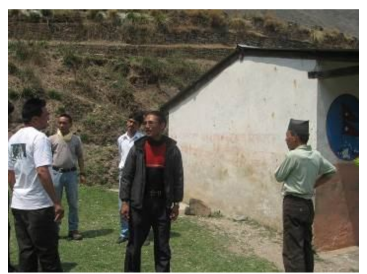
At this place the new class room is supposed to constructed

In June 2009 we visited the school together with Sandra Ihlein. We were able to deliver lots of the necessary school materials (exercise books, school bags, pencils, chalkboards, board marker, instruments as well as game devices and sport devices) and medicine. The greeting and the joy of the children were overwhelming.